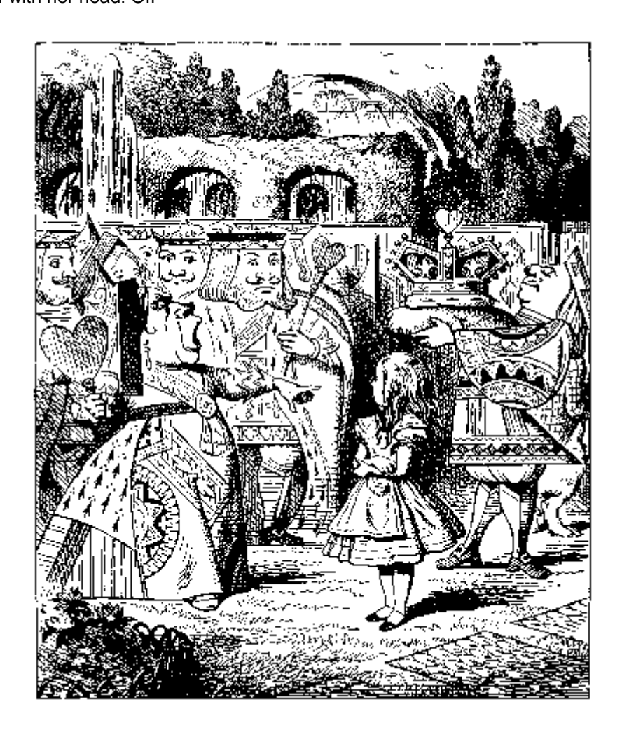
'Nonsense!' said Alice, very loudly and decidedly, and the Queen was silent. The King laid his hand upon her arm, and timidly said 'Consider, my dear: she is only a child!'

The Queen turned crimson with fury, and, after glaring at her for a moment like a wild beast, screamed 'Off with her head! Off—'